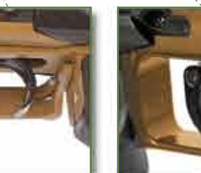
Winter trigger guard optional