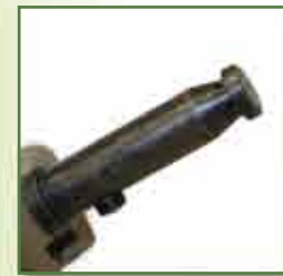
Parker Hale adapter optional