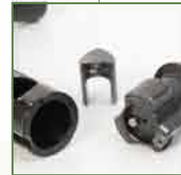
Easy calibre change