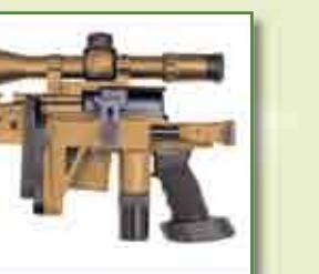
Folding stock right option: fixed / left