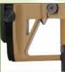
Sandbag rest optional