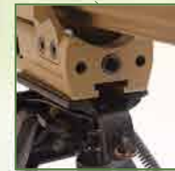
Adapter for stock extension