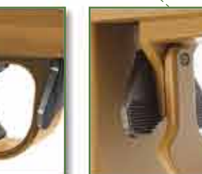
Adjustable two stage trigger