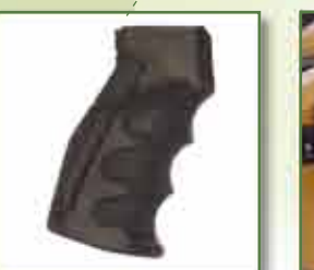
AR15 standard for a variety of grips optional