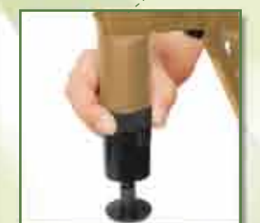
Quick and fine height adjustment