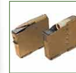
Different magazine sizes