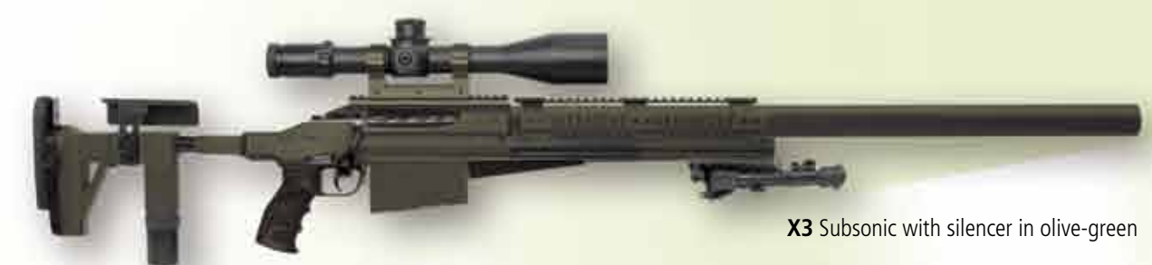
X3 Subsonic with silencer in olive-green