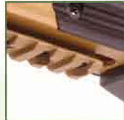
Adapter rail optional