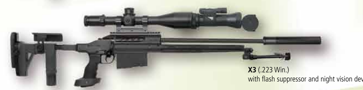
X3 (.223 Win.) with flash suppressor and night vision device