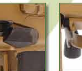
Ambidextrous safety switch optional