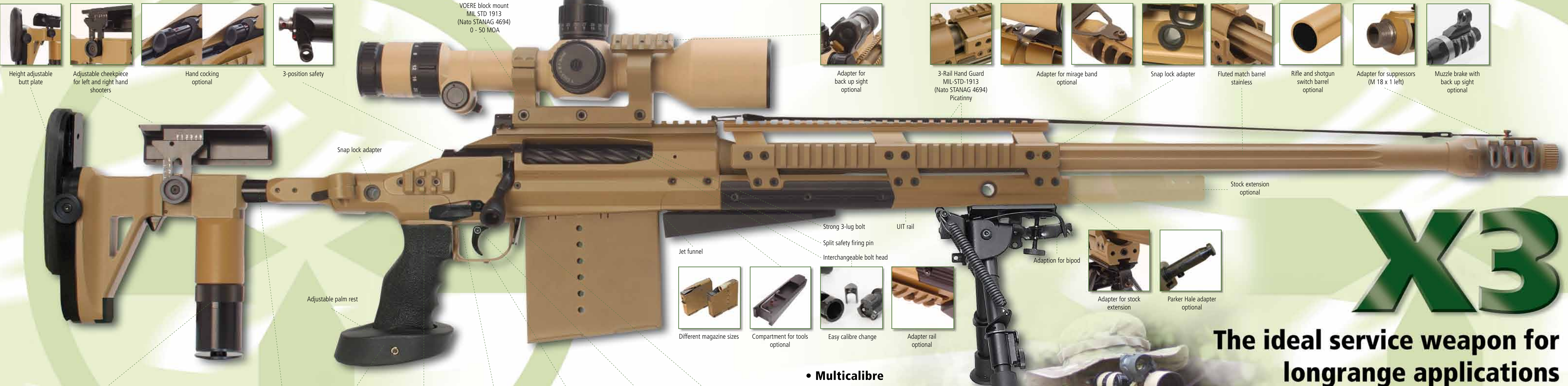
VOERE block mount MIL STD 1913 (Nato STANAG 4694) 0 - 50 MOA