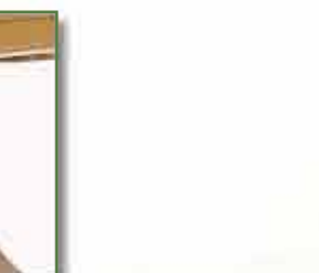
Ambidextrous magazine catch