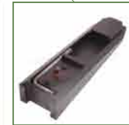
Compartment for tools optional