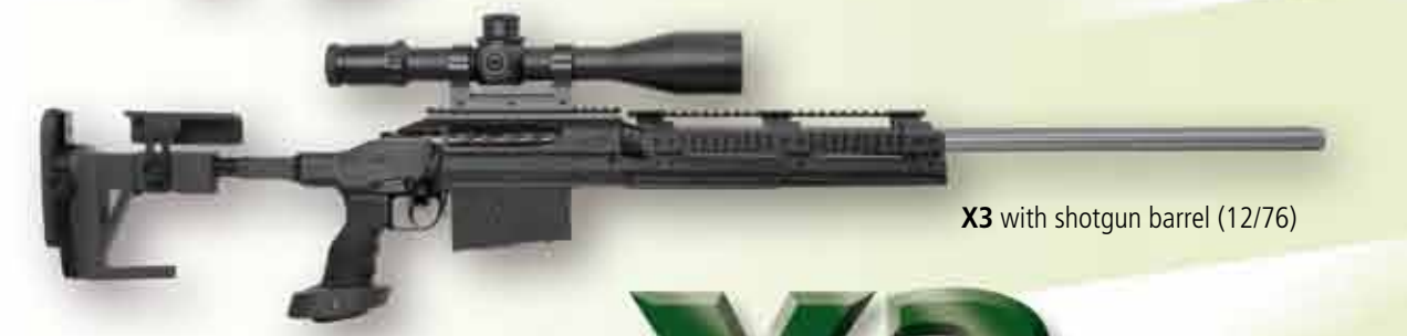
X3 with shotgun barrel (12/76)